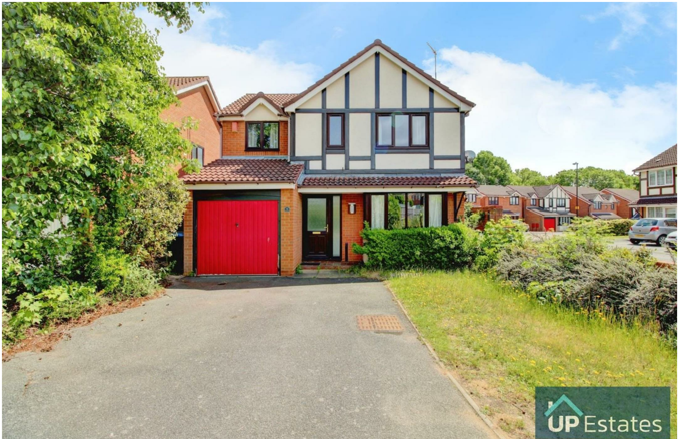
Skipworth Road, Binley, Coventry